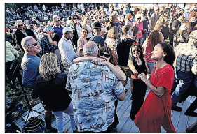
The Krush Soul and Blues Festival at the Krush Backyard in Santa Rosa gets attendees dancing.