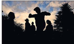
The fog rolls in as those attending the Krush Soul and Blues Festival dance in Santa Rosa.